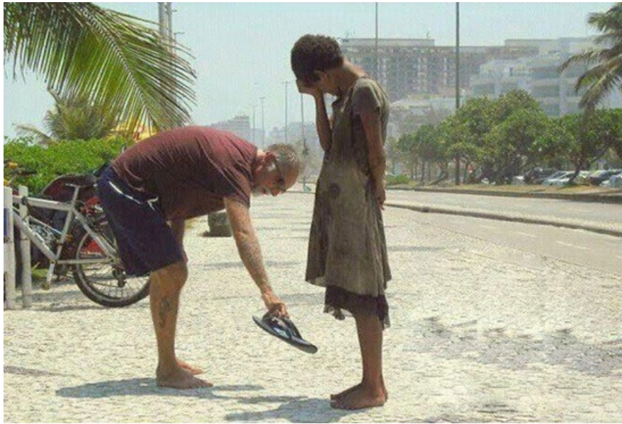
A man moved into action after realising the pain his fellow human being was suffering.

The lack of compassion is just driven by the factors mentioned above and maybe even some more, like cultural/religious ideas, lack of valuing of the individual human being's life in comparison to the group or country's interests, and ultimately, fear-driven, wanting to stay away from legal troubles or the questioning by the authorities.