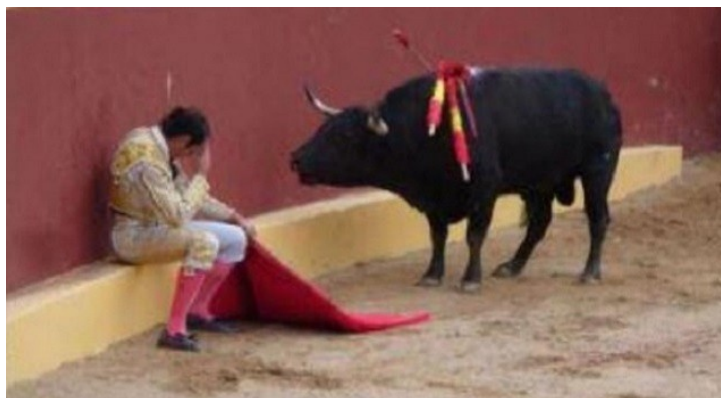
A bullfighter after realising the pain he was inflicting on another being.

No different rules of humanity apply in the overpopulated China. Nor do different humanity rules apply in India or other massively overpopulated countries. The rules of humanity are all built into the human being's inner nature all the same.